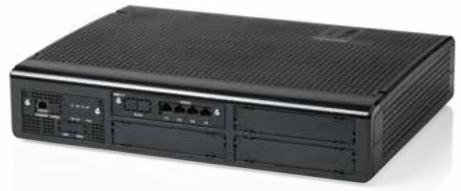
SL2100 Communication Server: Scalable from 1 to 128 users