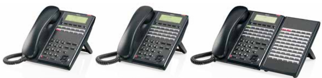
TDM Handsets: Easy call control from the office

Discover more: > SL2100 Communications System (Info Sheet)