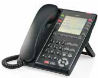
IP Handset: Easy call control from the office, remote office or home office